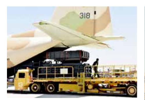
Transportable by C-130